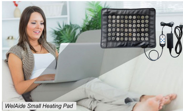
WelAide Small Heating Pad

WelAide heating pads utilize far infrared from natural jade stones to help provide temporary relief of minor muscle/joint pain and stiffness.