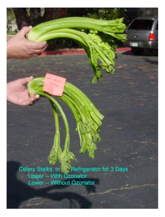
Pictures No 5 Celery Stalks Remained Turgid With Ozone (Upper sample), Lost Rigidity After 3 days Without Ozone (lower sample)