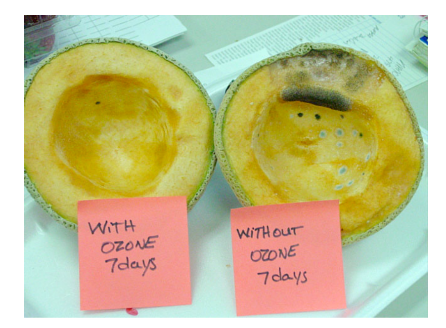
Picture No. 4 Cut Cantaloupe in Refrigerator for 7 Days, With Ozone on Left side, No Ozone on Right Side.