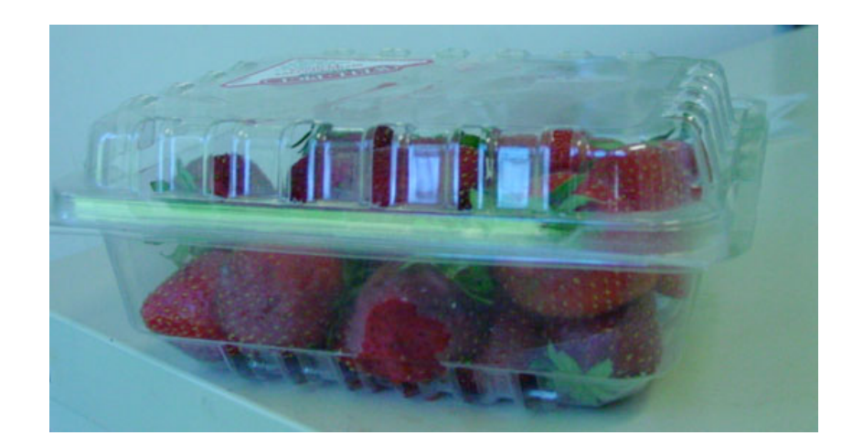
Picture No. 9 Fresh Strawberries were Stored in vented Plastic Store Boxes