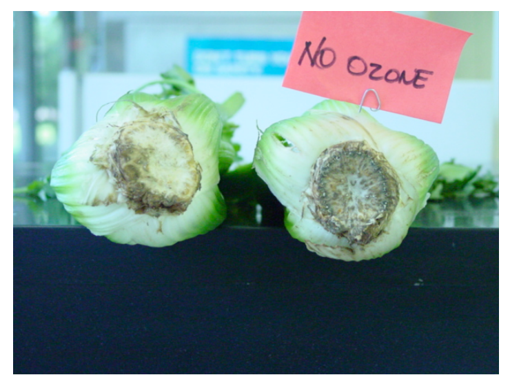
Picture No. 7 Butts of Celery Stalks. Left side with ozone remained acceptable for 7 Days; Right side without Ozone for 7 days darkened and showed heavy mold growth.