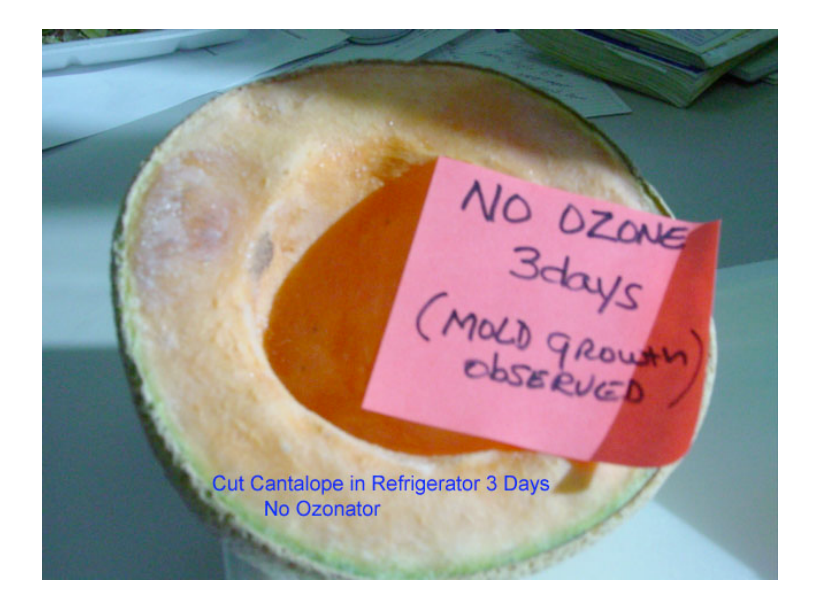
Picture No. 2 Cut Cantaloupe in Refrigerator 3 Days Without Ozone. Note mold spots on cut surface.